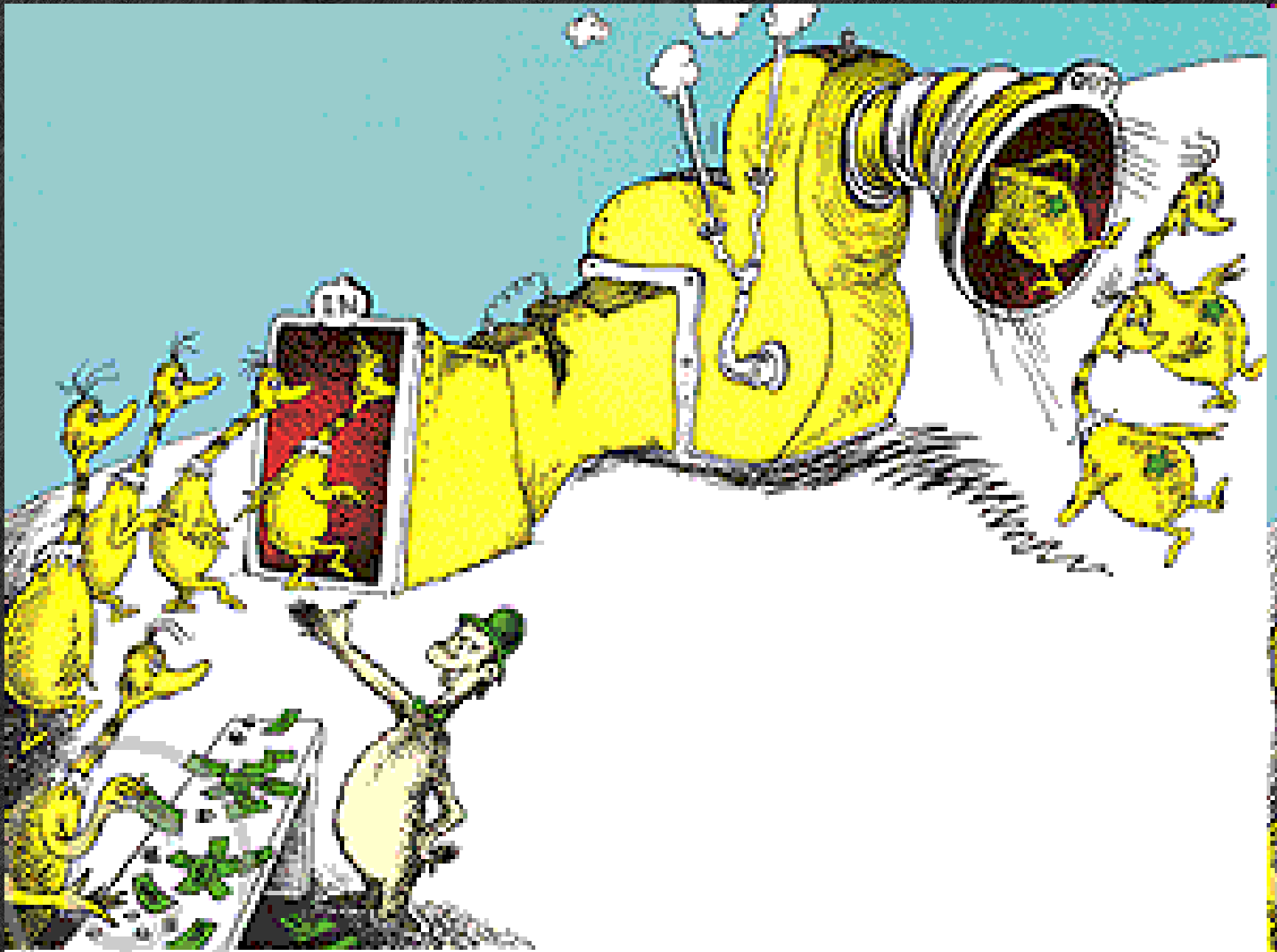
Illustration by [Name] for [Publication]